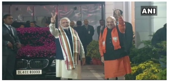
18 December 2017: It is 2-0 to the BJP, which has swept Himachal Pradesh and has also won Gujarat again, though by a decidedly lower margin of victory than last time.

The BJP has won 99 of Gujarat's 182 assembly seats. Prime Minister Narendra Modi said that the BJP's win in both states is a thumbs up for his government's reforms. Congress president Rahul Gandhi conceded defeat saying his party "accepts the verdict."