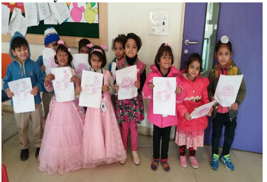
11 December 2017: At 7 i World School Pink Day was celebrated. The tiny tots with their beautiful pink attire plunged into colouring and drawing activities with enthusiasm and vigour. It was indeed a visual treat to witness the little ones glowing in pink.